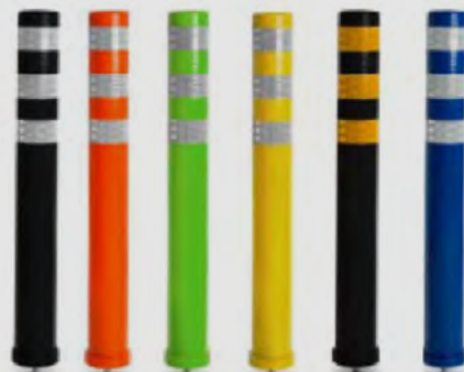
Available in a Range of Colours

VeloFlex Screw-In Reboundable Bollards are ideal for Cycle Lane delineation. They have a small footprint so when installed on the carriageway or footpath take up a minimal amount of space. They are soft and forgiving if a cyclist accidentally collides with the bollard but are also very durable and will survive multiple impacts from passing vehicles. They are fast and easy to install and this minimises the amount of time the installer working on a live road, thus improving safety for the installation crew. Their ability to survive multiple impacts means they offer exceptional value and will continue to function for extended periods.